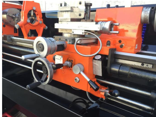
Left or right handwheel